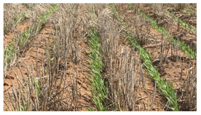
Paddock scale on-row seeding