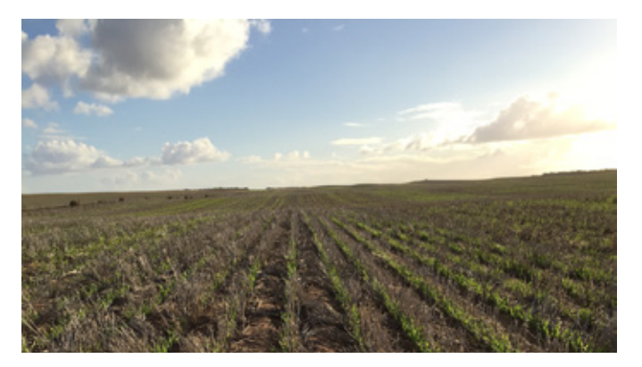
Paddock scale on-row seeding

The ProTrakker demonstration site was show cased at the Mallee Sustainable Farming Field Day in September 2015.